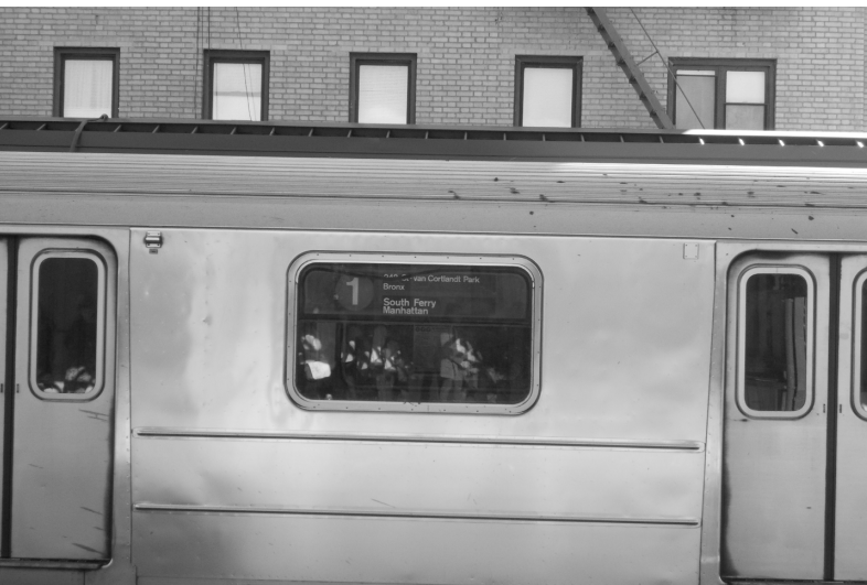
Giancarlos, age 8