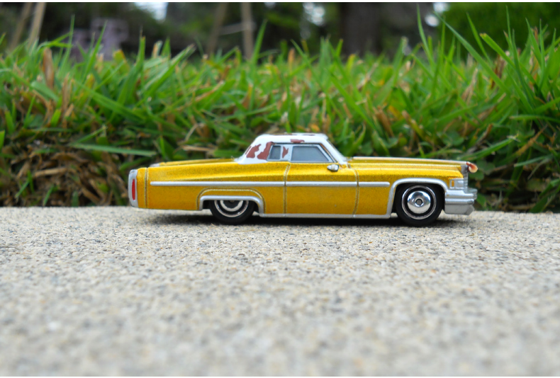
Leslie, age 10