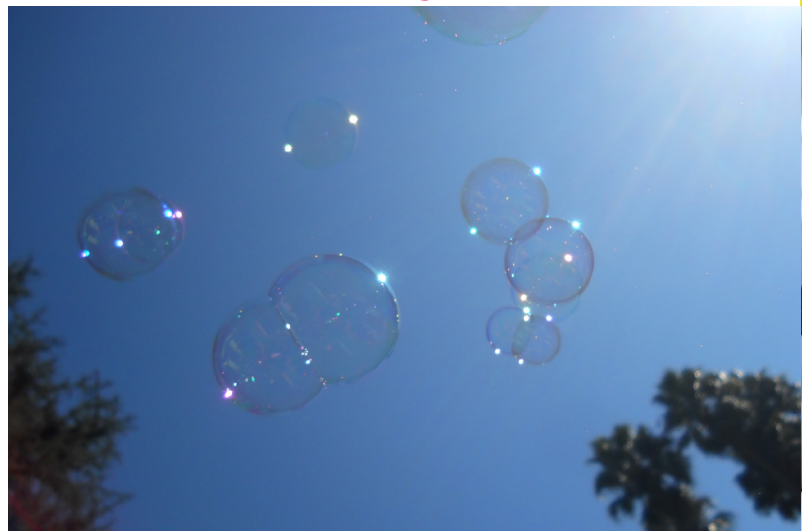
Emory, age 11