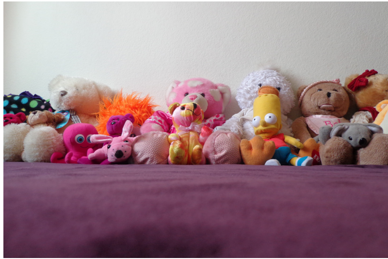
Chymanee, age 9